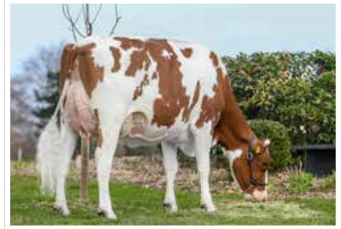
DTR SCHAGO ALADDIN JAMY RED VG85 2YR

HBN: HONLD000573341225 AI Code: H04617 Dam: R DG Avira Red VG85 2nd Dam: BTS Avea Red VG87 3rd Dam: KHW-I Aika Baxter VG89