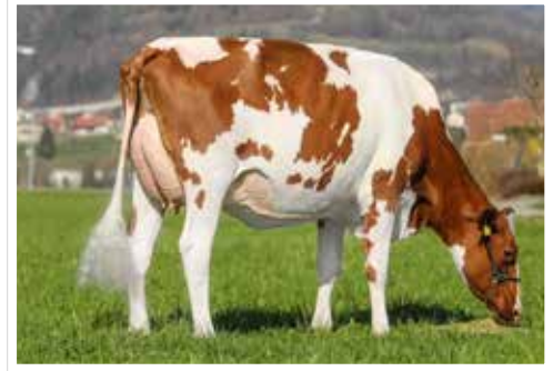
DTR LES ADOUX ALADDIN DYNASTIE RED VG85 2YR